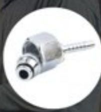
Hydraulic End Fittings