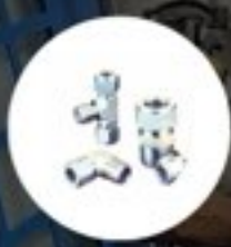
Tee - Elbows SS/MS